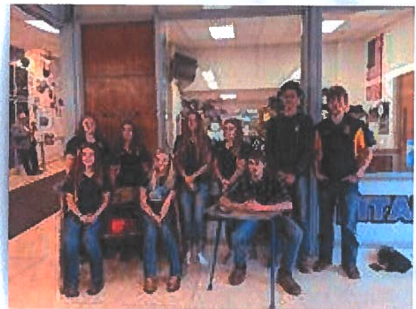
Triway Local Schools students in the Agriculture Education Class present information at the Fall Advisory Team Meeting