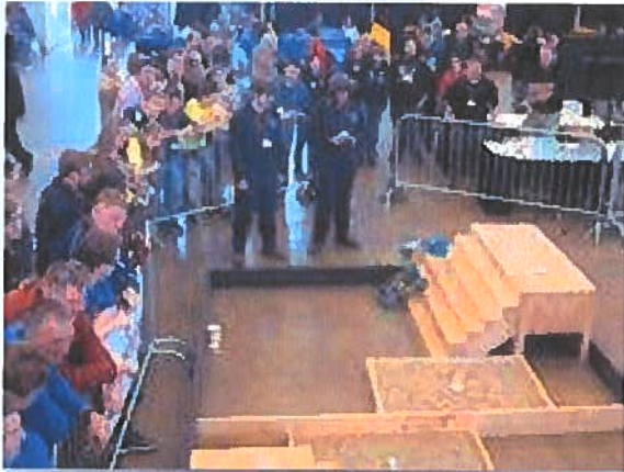
Chippewa Local Schools students participate in Robotics Competition