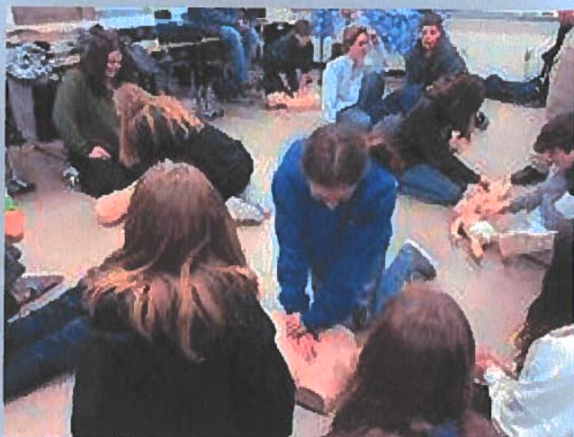
Chippewa Middle School Students work on developing their skills in the Health Careers CTE Class

The Business Advisory Council (BAC) is committed to building collaborative partnerships among education, business, and community. The BAC will advise school districts on curriculum and broadening exposure to the world of work in order for students to extend their learning beyond the classroom and gain the valuable essential skills needed for success after graduation.