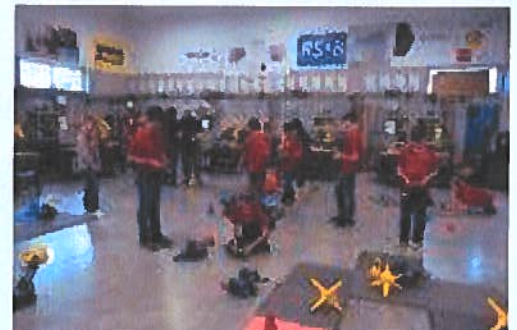
Students at VEX IQ Robotics Summer Camp practice their skills in the arena