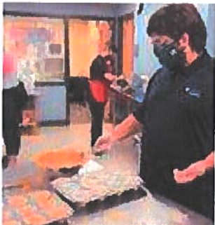
Students learn hospitality skills in the Career Cafe at Wayne County Schools Career Center